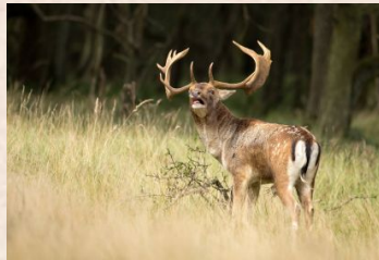
Fallow Deer (Europe)