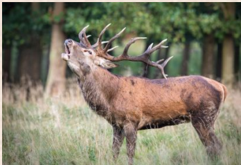
Red Deer/Red Stag (Europe)