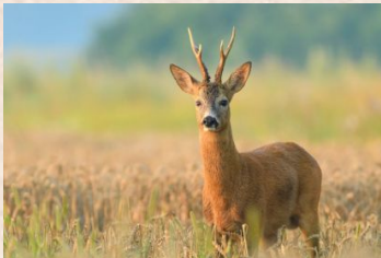
Buck/Roe Buck/Roe Deer (Europe)